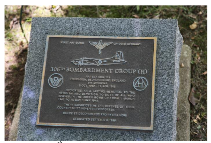
306<sup>th</sup> Bombardment Group Memorial