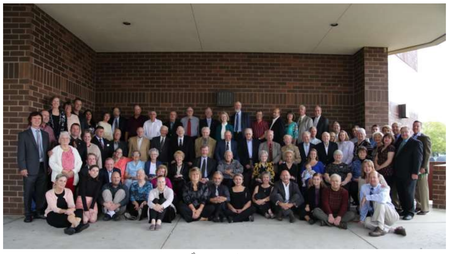
306<sup>th</sup> BGHA 2016 Reunion Attendees