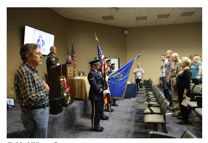
Folded Wings Ceremony