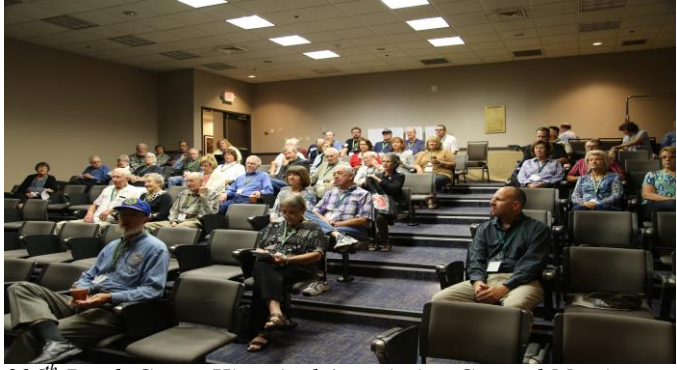
306th Bomb Group Historical Association General Meeting