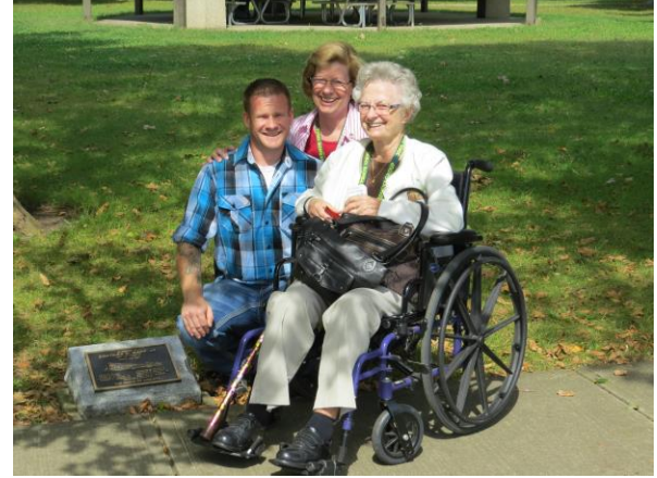
"Hard to Get" Crew Memorial